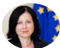
Věra Jourová Vice-President European Commission