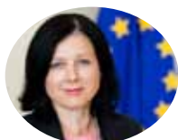
Věra Jourová Vice-President European Commission